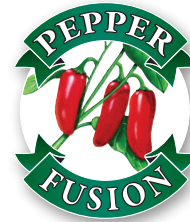
Black Peppercorns with Chipotle