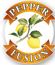
Black Peppercorns with Lemon