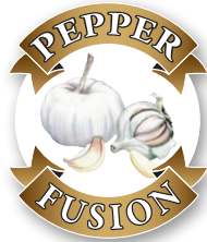
Black Peppercorns with Garlic